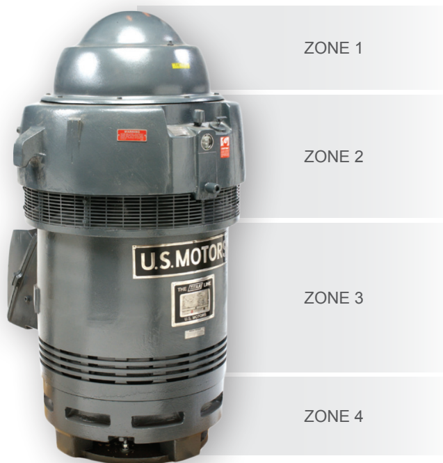
WPI 15-5000 HP and WPII 300-5000 HP

† All marks shown within this document are properties of their respective owners.