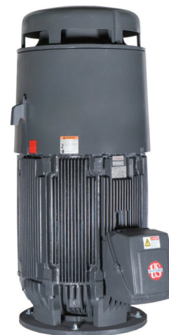
TEFC and Hazardous Location 3-2000 HP

Cast iron CORRO-DUTY® motors are available with external corrosion-resistant paint and hardware for extremely harsh environments.