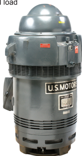
WPI 15-5000 HP and WP II 300-5000 HP